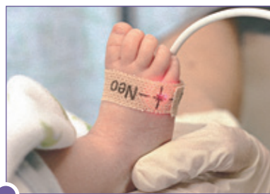
Masimo Pulse oximeter*