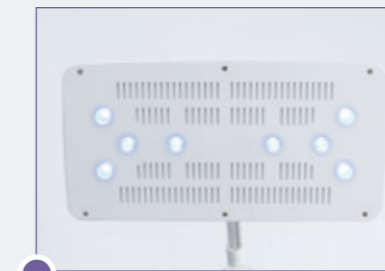
8 Power LED