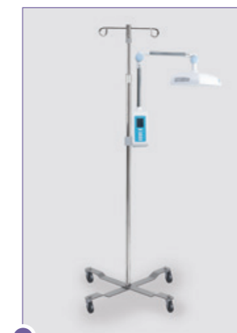
with IV pole