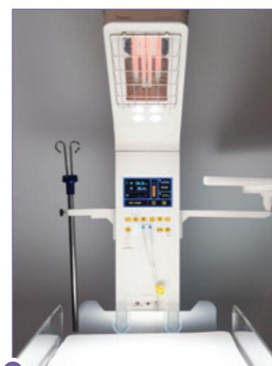
LED examination light